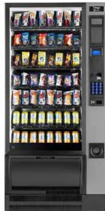
Foto viser ikke den specifikke model. Der henvises til layout nedenfor for specifikt varenummer.