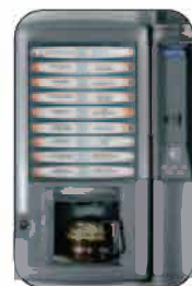
Cup station accepts up to 14 cm high jugs.